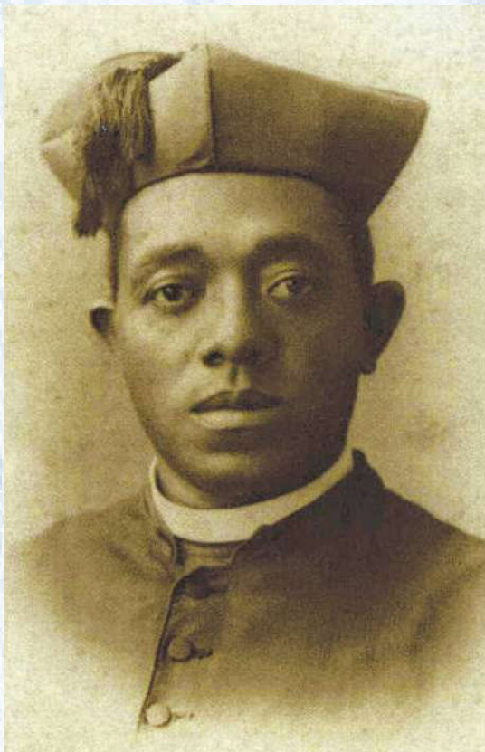
Servant of God Augustus Tolton (The first known African-American Priest)